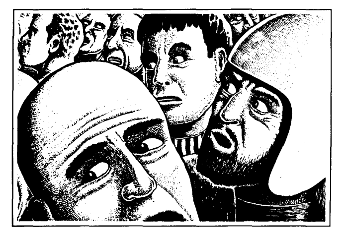
The Philistines were alarmed by the loud cheers coming from the Israelite camp.

"Who will deliver us from the hand of these mighty gods?" many of the