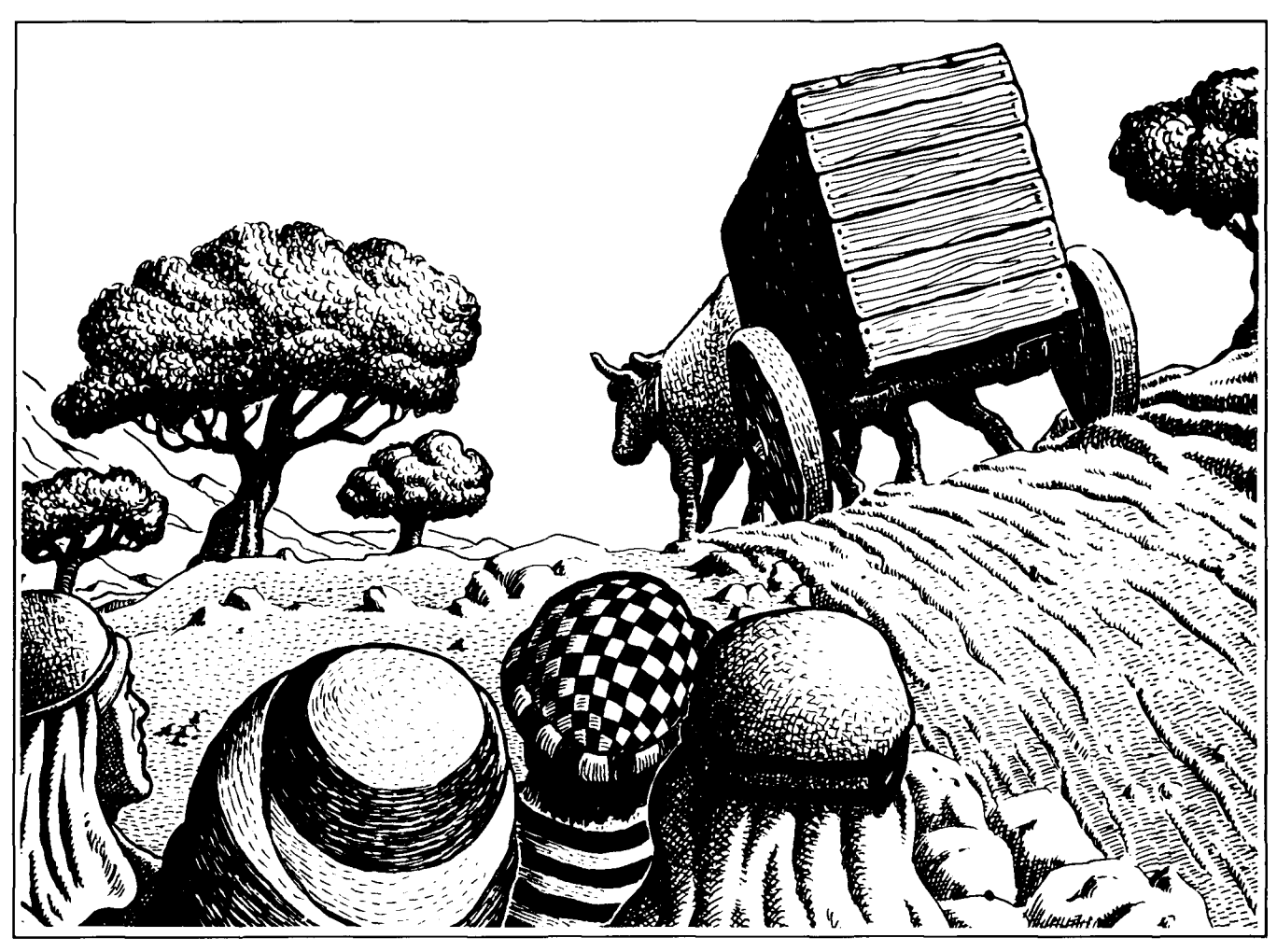
The Philistine leaders anxiously watched to see which direction the cows would pull the cart.

Soon the whole village knew about the discovery. The cows were killed and offered as a burnt offering, with the wood from the cart serving as fuel.